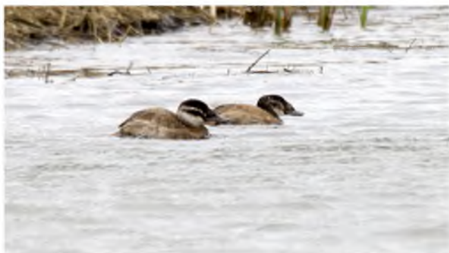
Fig. 1. Two females of Oxyura leucocephala in the natural ornithological park in the Imeretinskaya lowland (Sochi, Russia).

In the late XX and early XXI centuries, Oxyura leucocephala was recorded in winter also in the coastal regions of the Crimea. On the basis of the observations of 1990–2011 it was believed that the wounded and weakened birds were left to winter (Grinchenko, 2011). However, according to other sources, Oxyura leucocephala winters in various parts of the Crimea periodically, and white-headed ducks were observed there in 2013 regularly (Andryushchenko et al., 2013).