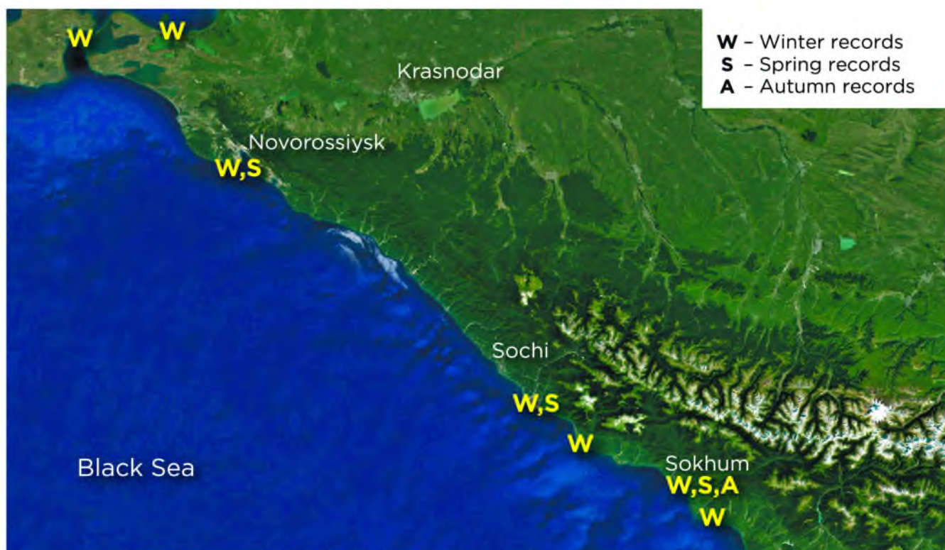
Fig. 3. Records of white-headed duck on the Black Sea coast of the Caucasus.