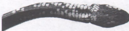
Figure 7. The head and the anterior part of the body of C. ravergeri , melanistic specimen from below (IZT, Manysh Village).