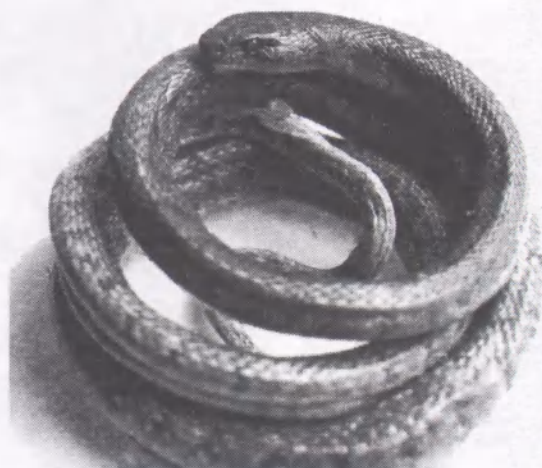
Figure 3. An uniform grey specimen of C. ravergeri with an unclear picture of the back side of the body and tail (IZT, village Sayvan, 1990; Coll. Atayev)