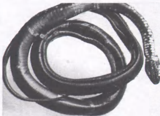
Figure 5. A melanistic specimen of C. ravergeri (IZT, Manysh Village): general view from below.