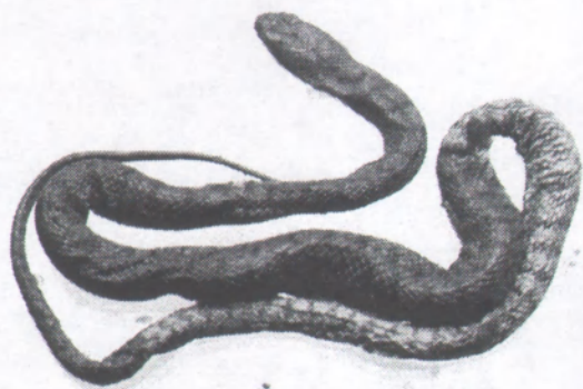
Figure 8. A young specimen of Coluber nummifer (IZT, Kugitang Mountains, 1981; Coll. Zakharova).

subadult V. lebetina obtusa , and this similarity extended to this species behavioral threat response. In Central Asian, young C. nummifer (Fig. 8) look like young V. lebetina (turantica/chernovi) , but C. ravergeri may be only remotely similar to Boiga trigonatum melanocephala .