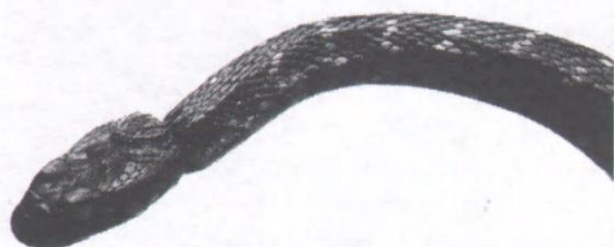
Figure 6. The head and anterior part of the body of melanistic specimen of C. ravergeri from above (IZT, Manysh Village).